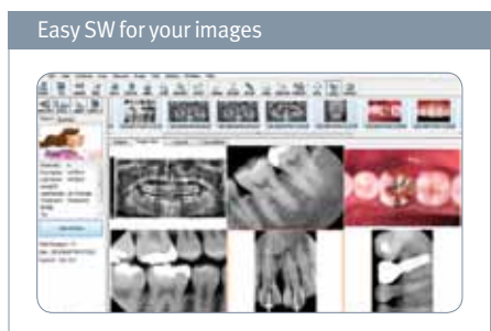
You can handle all images taken from intra- and extra- oral equipment with EasyDent very easily - saving, organizing, retrieving, printing, and showing.