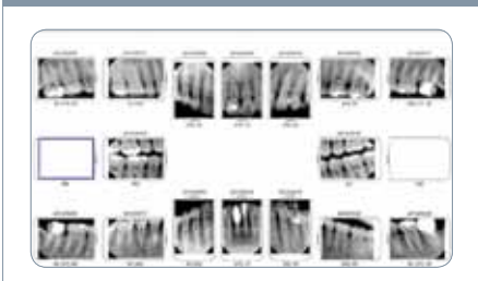
With EasyDent 4, you can easily take the full mouth images and get very detail look at each tooth. Customizing the layouts and image acquisition order is allowed.